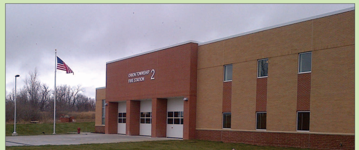
After construction - December 2014