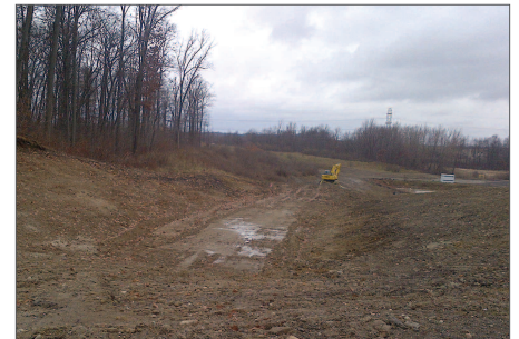
Trenchwork facing north

perforated pipes that will allow this naturally occurring perched water to be released and flow into the local wetlands to the north of the site. One of the woodlots at Eagle Valley has also been cleared. The two existing flares and land-