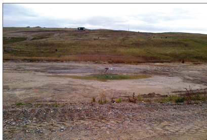
Perched groundwater at excavation

Waste Management is preparing the west area of the site for new cell development in 2015. Part of this preparation involves installing an underdrain system to remove perched groundwater. Perched groundwater refers to sand and gravel layers containing